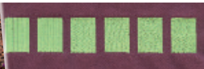
Chapter 5: Basic stitch types 551 PUNCH - Digitizing for Embroidery Design

This sample shows the six basic stitch rhythms starting from the left with the rhythm one going up to six.